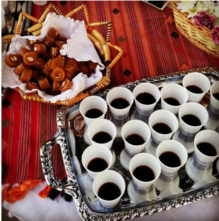
Classic Cypriot welcome treats served to guests: soujouko (corner left) and carob drink

Tailor-made holidays embedding culture, gastronomy, wine, and history are the bread and butter of Wild Discovery. Navigating the travel agency’s website alone gives you an impression of just how thematic trips can be, and no destination is too far-fetched! With tours under the headers of “ Best of Argentina ,” “ Best of Chile ,” and even “ Mayan Route ,” you can expect luxury, refinement, and spectacular historical heritage combined into one.