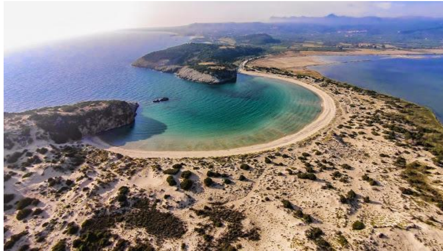
Voidokilia Beach in Costa Navarino, Messinia, resembles the letter omega ( \Omega )

On a second trip, Wild Discovery steered us to another direction of Greek natural paradise, this time north to Halkidiki , destined for the tip of one of its jutting peninsulas called Kassandra. Again, an azure sea – the Aegean – and a luxury resort and oasis formed our veritable Garden of Eden. Wild Discovery organized our hike with a biodiversity expert, who led us through blooming forests extending to the beach wherein we discovered the Sani wetlands and a bird sanctuary.