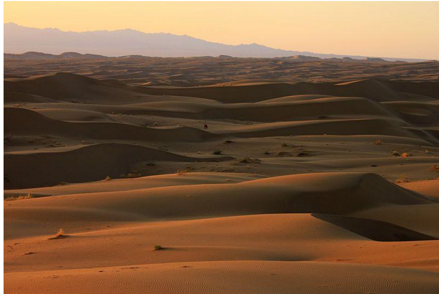
The Kavir desert in Iran

Ever yearned to tour the Persian deserts ? Wild Discovery packs in picturesque desert scenes with beautiful sand formations, followed by a taste of culture, architecture, and lifestyle in major metropolises like Tehran and Kerman.