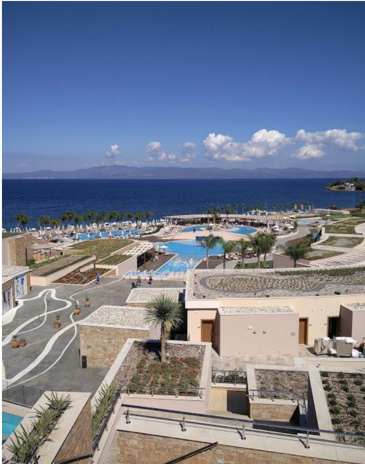
Miraggio Thermal Spa Resort (Kassandra, Halkidiki, Greece)