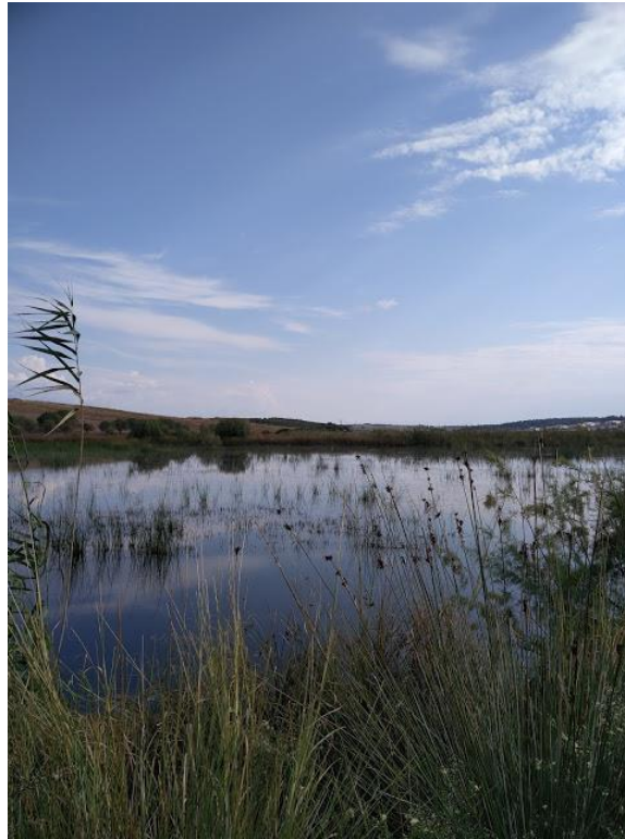
The Sani wetlands are home to a bird sanctuary

Beyond Greece, I witnessed Cyprus through a totally different pair of lens, again owing to Wild Discovery's distinctive approach to travel. How often do we as Lebanese overlook Cyprus merely because it is a stone's throw away? Larnaca and Limassol lose out to Lisbon and London when we brainstorm hotspots for a European getaway.